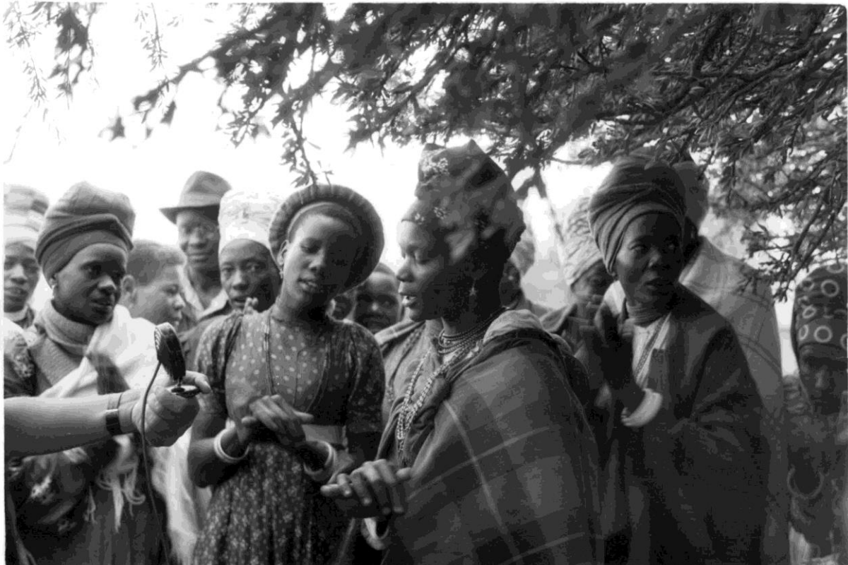
Recorded performance, Omaruru (Namibia), 1954. BAB PA.39 D01 1281.

In cooperation with the Swiss Society for African Studies (SSAS/SSEA/SGAS)