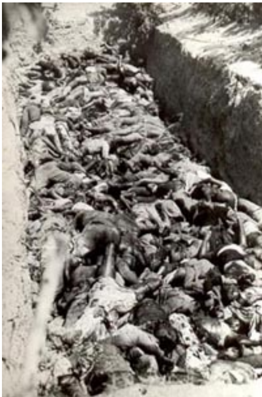
Fig. 1 Mass grave, Cassinga (Pagano)

sory examination of the photographs. The most widely disseminated photograph [Figure 1] is a black and white print showing the body of a woman in a dress prominently visible in the foreground and lying on top of a pile of bodies. 16 It was widely syndicated and published by newspapers such as Basler Zeitung under the caption “Ein Dokument des Grauens”. 17 In June SWAPO issued its eponymous bulletin with the same image appearing on the cover with the byline “Massacre at Kassinga: climax of Pretoria’s all-out campaign against the Namibian resistance”. 18 The picture was included in the Kassinga File, a collection of images compiled by Pagano and Swedish filmmaker Sven Asberg. 19 The file was distributed to the network of agencies and organisations affiliated to the international anti-apartheid movement. These organisations distributed and displayed the images of the mass grave at public exhibitions and in publications. The shot became emblematic of the Cassinga massacre.